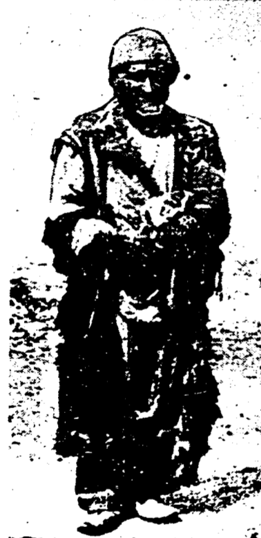
Freed from concentration camp in Russia, a Pole in rags is pictured about to cross frontier to freedom in Iran. The picture was taken in 1943.

Reds made a house to house search and arrested officials, professional men, land owners and other educated persons. When all the jails were full, the Reds used school houses and other public buildings to house their prisoners. The congestion was relieved by transporting trainload after trainload of Poles across the Russian border to Minsk."